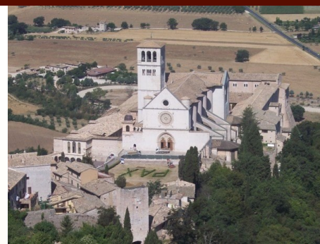
Basilica of St. Francis Assisi

Though too soon, your Italian adventure has come to an end. Private motorcoach will be provided to Roma Fiumicino Airport for your flight to Newark/New York. You'll arrive home in time for 4th of July Fireworks.