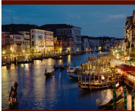
Grand Canal Venice