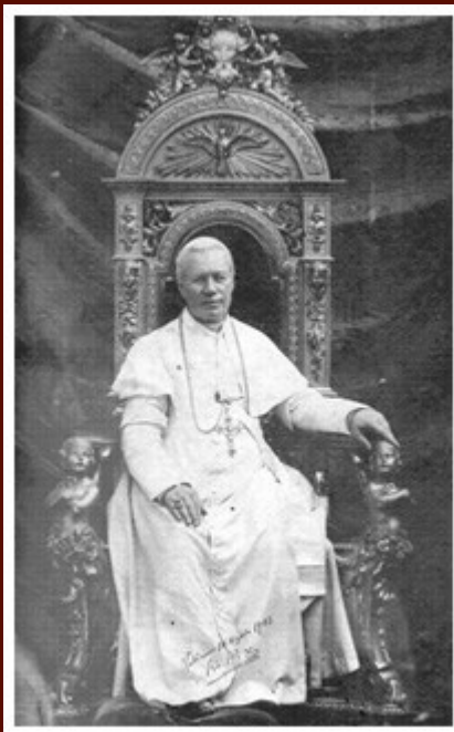
St. Pius X 1835-1914