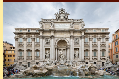
Trevi Fountain Rome