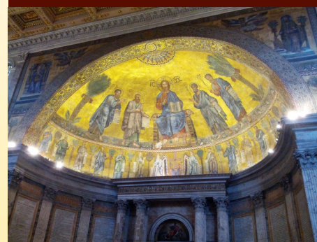
St. Paul Outside the Walls Rome